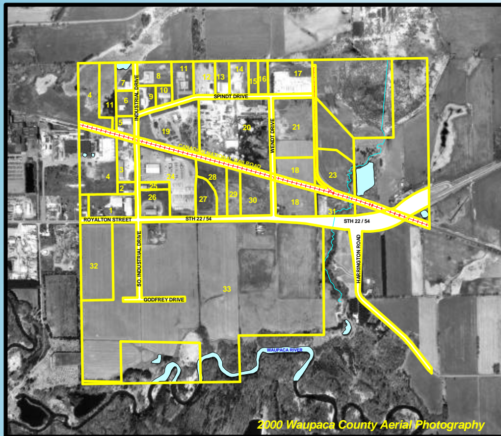
2000 Waupaca County Aerial Photography