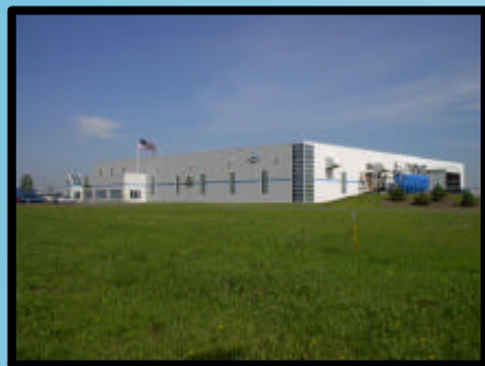
DANA BRAKE PARTS